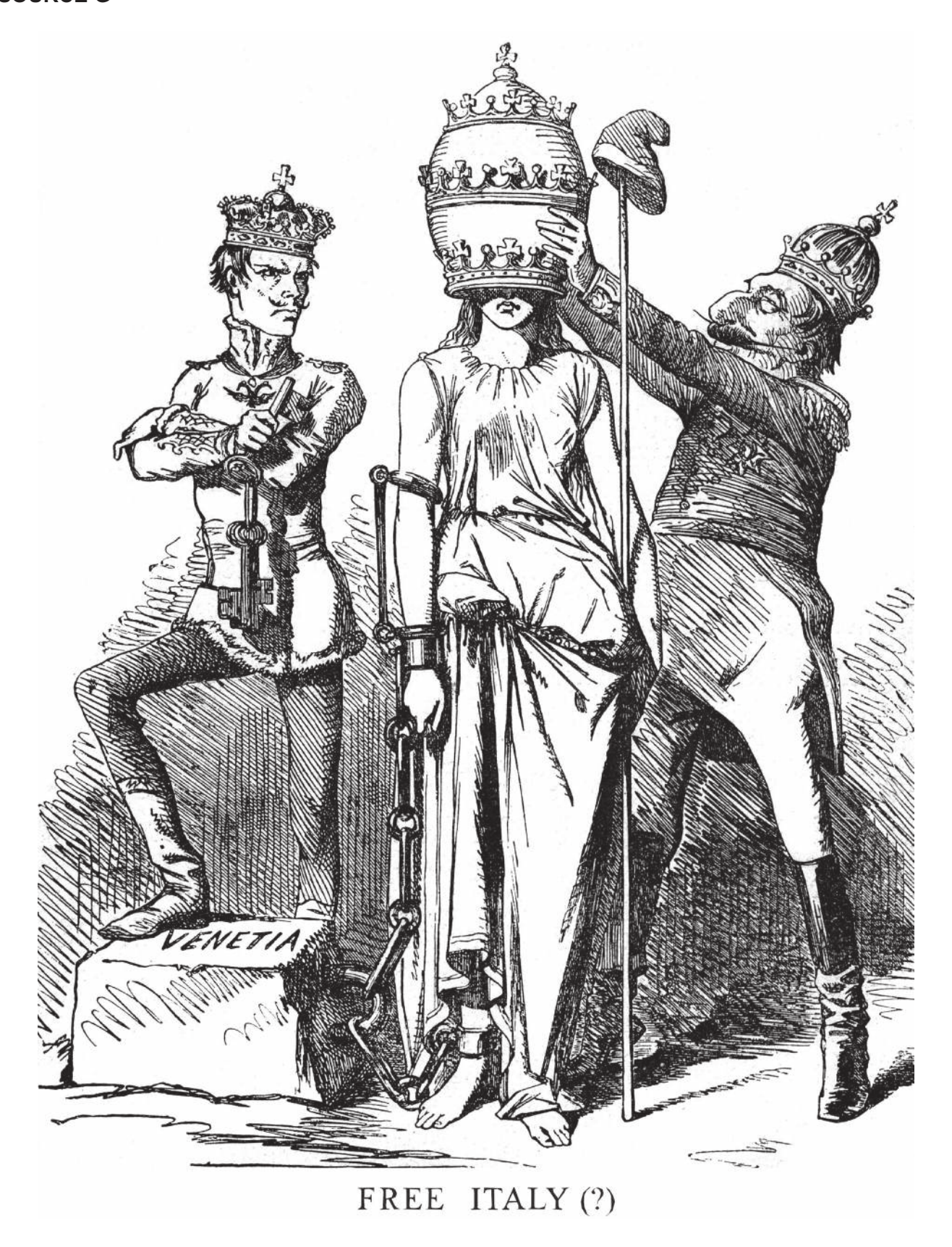
A cartoon published in a British magazine in July 1859. The figures represent (left to right) Austria, Italy and Napoleon III. Italy is wearing the Papal crown.