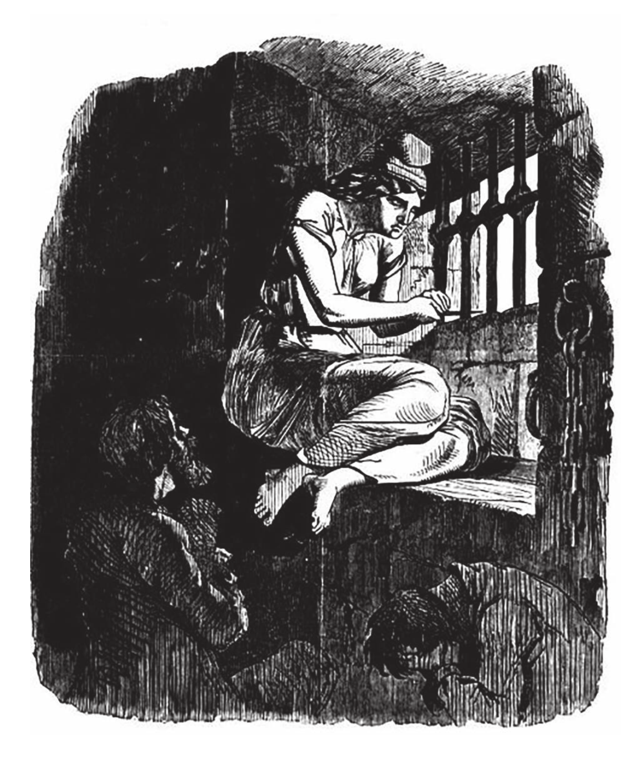
An illustration published in a British magazine, September 1856. It is entitled 'Liberty files the Austrian Bars of Italy.' 'Files' means cuts away.